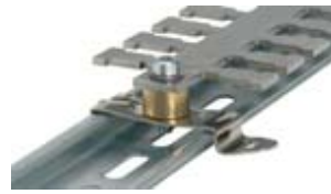
Type SF: Mounted on snap foot for DIN-rail shape H