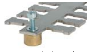
Type DH: Mounted on bushing for flexible fixation on bottom sheet