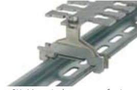
Type SK: Mounted on screw-foot for DIN-rail shape H