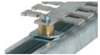
Type SC: Mounted on screw-foot for DIN-rail shape C